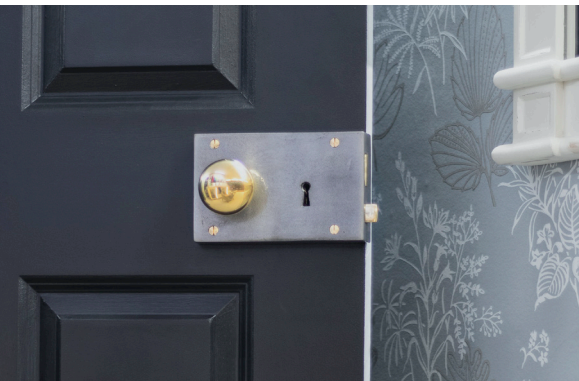
Internal rim lock/latch