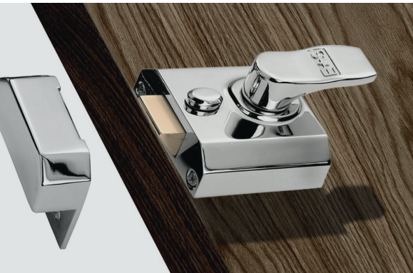
Cylinder rim nightlatch