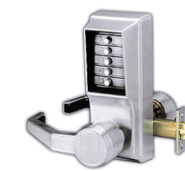
Mechanical digital lock

They are only available as fail unsecure (unlocked) and for this reason they are generally seen as low security solutions. They can be used on inward and outward opening door depending on bracketry used.